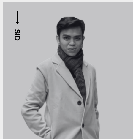
Social Media and Graphic Design