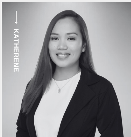
Administration and Accounts

→ Mobile: 0426 413 467 email: pm2@platinumpropertyco.com