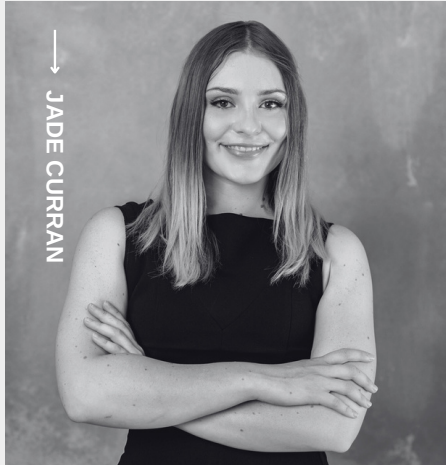
→ Junior Property Manager

→ Mobile: 0406 613 300 email: pm3@platinumpropertyco.com