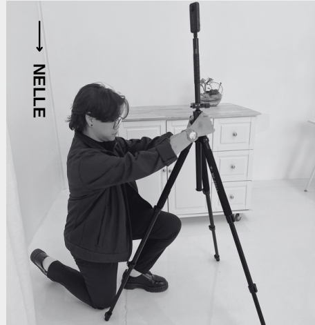
→ Investment Growth Manager

→ Mobile: 0406 613 300 email: pm3@platinumpropertyco.com